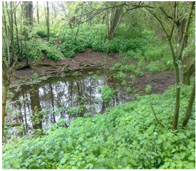
Heavy rain over the last month has seen the East pond up at the Hillfort fill with water.

Nature Walk at Mowsbury Hillfort Bring-a-Friend' Session 2pm-4pmMeeting at Mowsbury Golf Club car park.