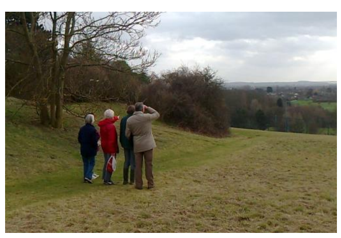
Panoramic noticed boards have been ordered and should be in place in the near future.

Data spreadsheets for viewing and data input for Putnoe Woods and Mowsbury Hillfort are now linked to the ecotable page on the web site.